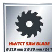
HW/TCT SAW BLADE Ø 210 mm X Ø 30 mm / 24 T